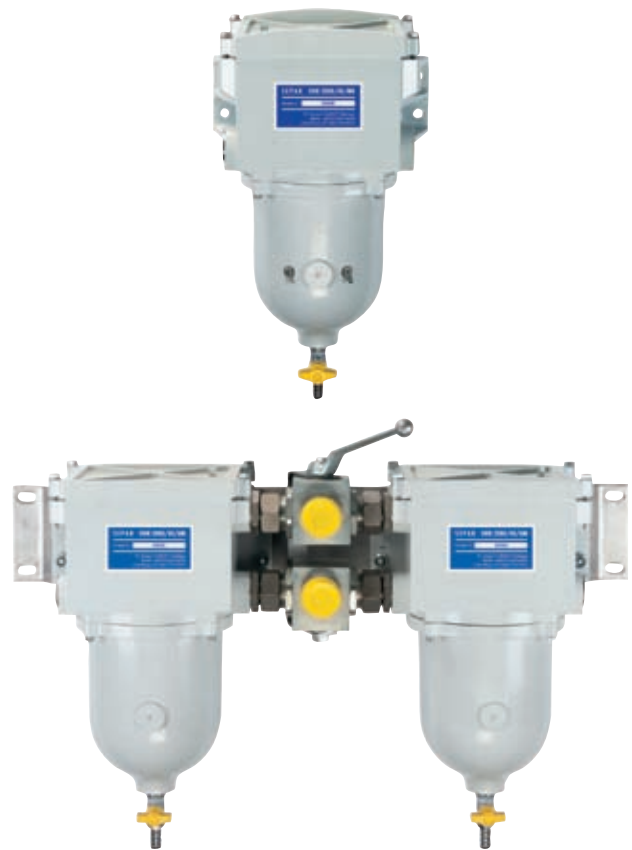
Shown: top 2000/40MK bottom 2000/40UM