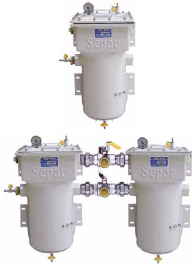
Shown: top 2000/130MK-G bottom 2000/130UMK-G